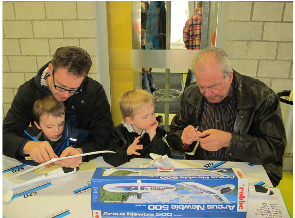
Model building and flying with children helps to win the public's trust and goodwill. Three generations – father with sons and grandfather building aeroplanes.

Everyone who has had the opportunity to admire a model aircraft – regardless of category or type – from up close, will understand that aeromodelling is a very demanding hobby with an extremely steep learning curve. This in turn helps to ensure that not only the general public, but also authorities and decision makers, gain a positive attitude towards model flying and model pilots.